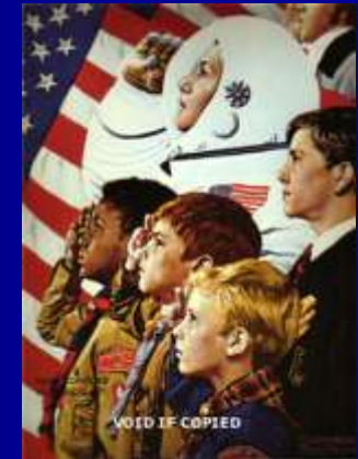
VOID IF COPIED

Handwritten symbols: a stylized 'R', a '6', a '9', and an ampersand '&'.