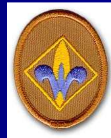
Fourth & Fifth Grade