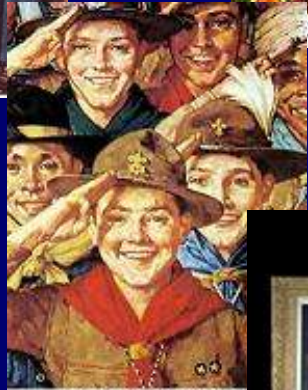
1983 An Act of Friendship