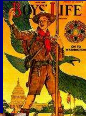
July, 1935 Boy's Life